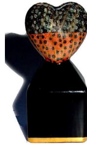
BCH01J L 2 1/2", xW 1 1/2", xH 3 5/8"