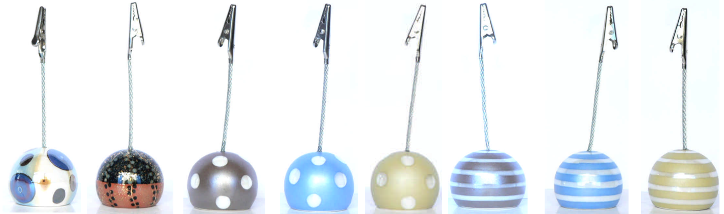
BCBR10 BCBJ BCBHRWD BCBHBWD BCBHGWD BCBHRWL BCBHBWL BCBHGWL Clip card holders are also available in the following designs: