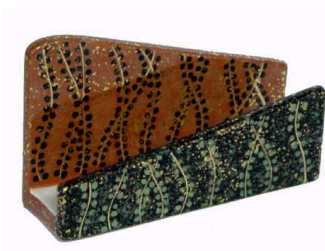
BCH02J (Also available in Design H – BCH02H)