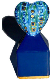
BCH01G L 2 1/2", xW 1 1/2", xH 3 5/8"